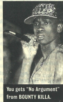
You gets "No Argument" from BOUNTY KILLA.